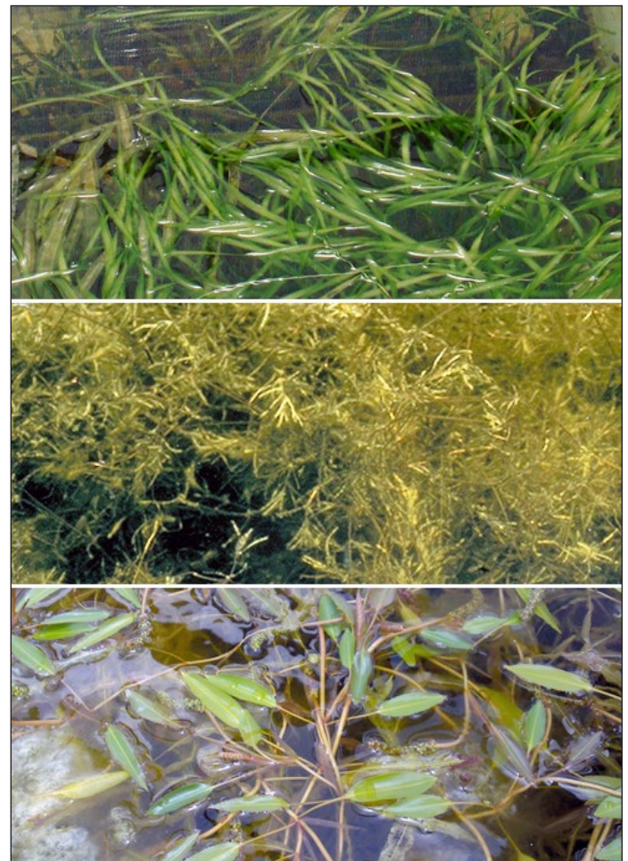
Figure 8. Native submersed plants. Upper: eelgrass. Center: southern naiad. Lower: Illinois pondweed.

In order to select the most effective weed control method, the invader must first be positively identified. The most common way to do this is to send high-resolu-